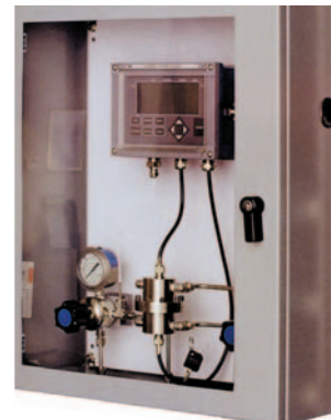
CHA with optional enclosure

Hydrogen concentration is critical in many different refining, petrochemical, and electric power generation applications whether being monitored as a reactant, product, process "health" indicator, or coolant. COSA/Xentaur configures the CHA to match each installation's unique sample conditioning and operational needs.